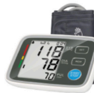
Blood Pressure Monitor